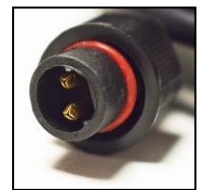
Female 2 Pin DConnect Plug & Play Adaptor