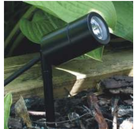
E4135 black Microspot Spike

Microspot Spike is a miniature 12v adjustable spike spotlight available in 316 stainless steel, natural copper or black powder-coated aluminium. It is intended for use in containers, urns and small planting pockets using an MR11 20w halogen reflector lamp or low energy 3w warm white l.e.d. lamp which is equivalent in output to a 20w halogen lamp. Microspot Spike is fitted with a 18cm slim rod spike fitted to the adjustable knuckle joint; this may be unscrewed and replaced with the optional 50cm extended spike mount without having to rewire the light: the 50cm extended spike is intended for use amongst taller planting or to cater for seasonal fluctuations in planting height. E4011 35mm glare louvre is an option for glare limitation near seating areas or viewpoints. Microspot Spike is also available in a twin spike spotlight version, supplied in kit form for on-site assembly