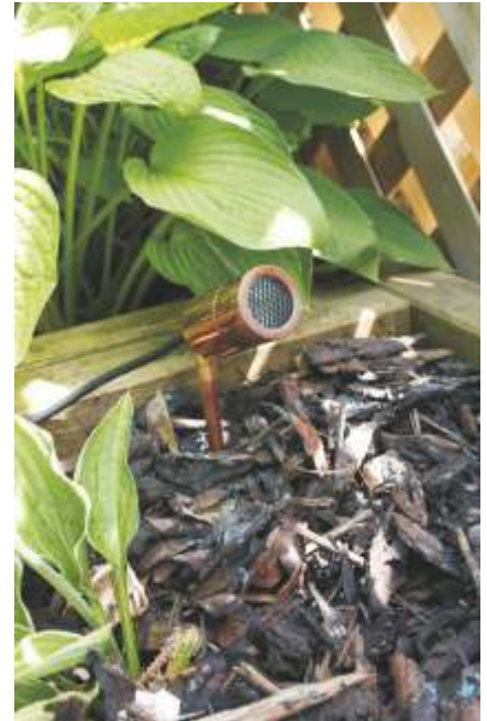
Copper Microspot Spike with optional E4011 glare louvre