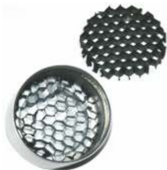
Above: The front bezel unscrews to fit an E4011 honeycomb glare louvre

Microspot Wall is a miniature 12v spotlight providing adjustable spotlighting for small features or grazing down pillars and pergola piers to emphasise structure: it accepts a 12v MR11 20w halogen lamp or 3w l.e.d. lamp. The front bezel unscrews for easy lamp changing or to fit a E4011 honeycomb glare louvre. The flush lens is easier to clean periodically. The base mount incorporates rear cable entry into a termination space and rotates on the back plate to achieve exact positioning.