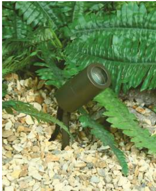
E4175 rustic brown Microspot Spike