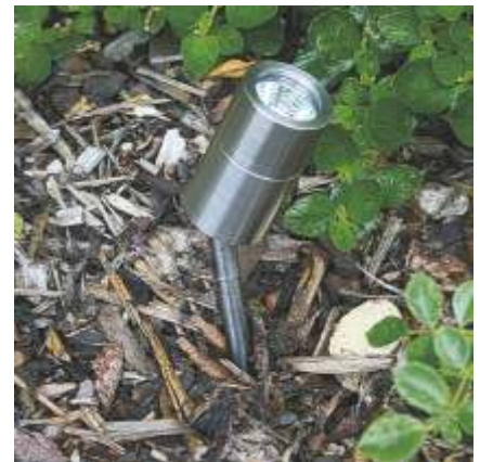
E4115 stainless steel Microspot

Microspot Spike spotlights require T9962 cable joint kit to connect to low voltage cable. Use T9962 cable splice kit to connect Twin Spike spotlights