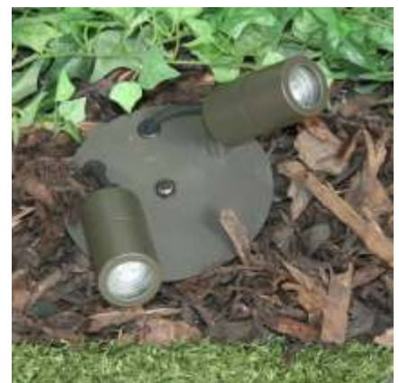
E4675 Microspot TwinSpike

A Microspot miniature spike spotlight located behind the crossed ankles of this sculpture of a boy positions a 20w halogen lamp to provide a striking lighting effect