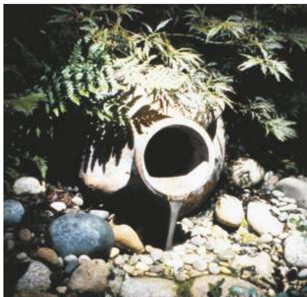
A 20w lamp in a Microspot Wall spotlight mounted on an adjacent pergola focuses attention on this small urn water feature >>>>>>